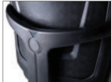
Back cover without lumbar support (PU leather)