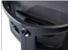
With lumbar support (Mesh)