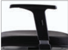
H1 - Height adjustable armrest with PU padding on top