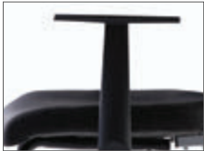
T1 - PP injection fixed armrest (For cantilever base only)