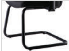
C1 - Cantilever base with studs