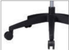
N1 - 5-star nylon base with castors